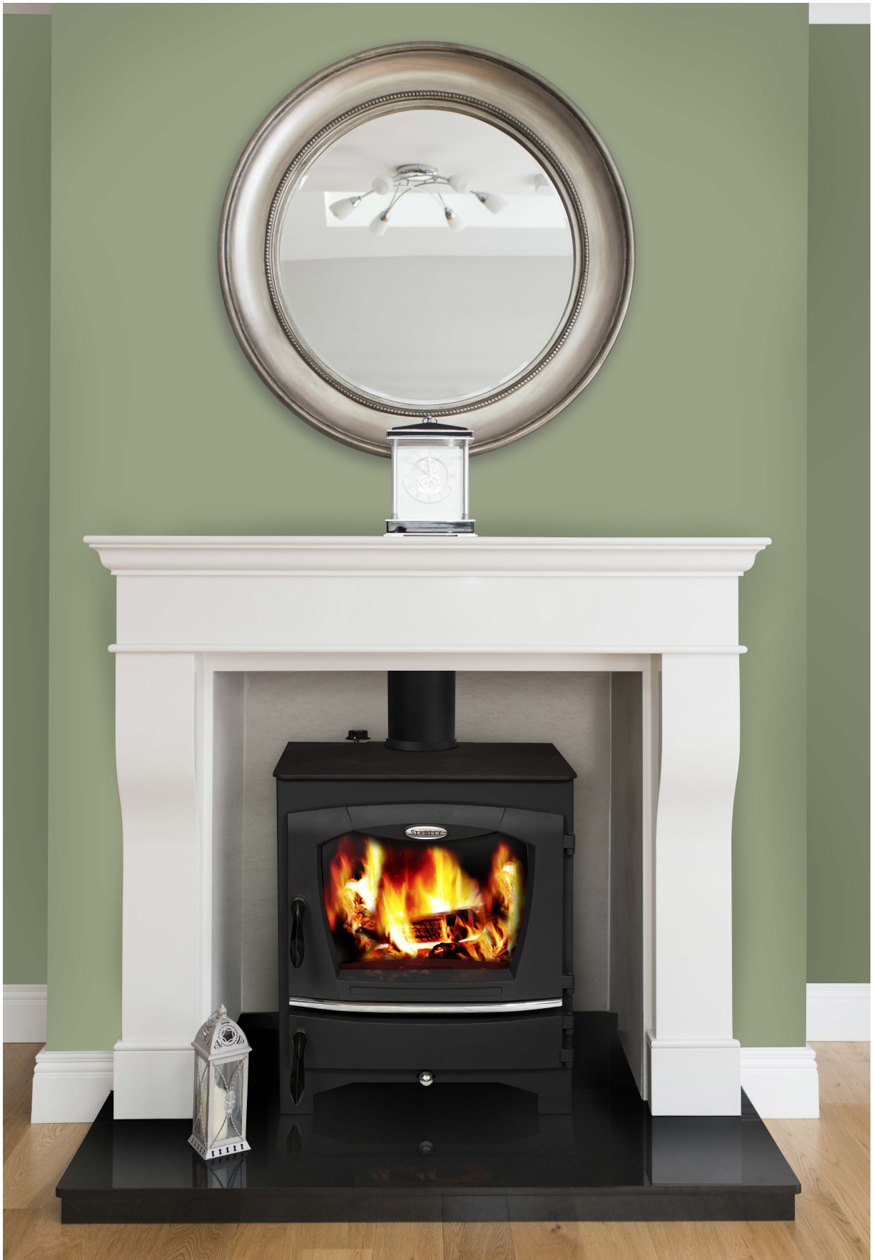
Stanley Fern Eco Stove