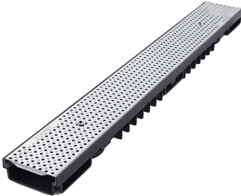
Technical sections of linear drain